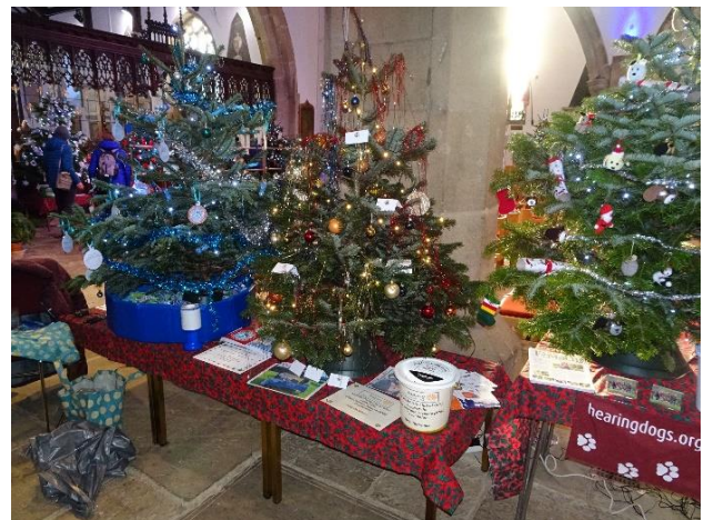
The Rotary Club tree also supporting MND