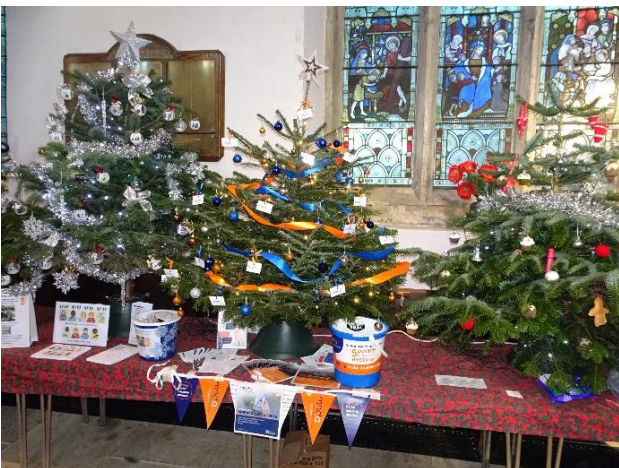
The tree resplendent in MND colours